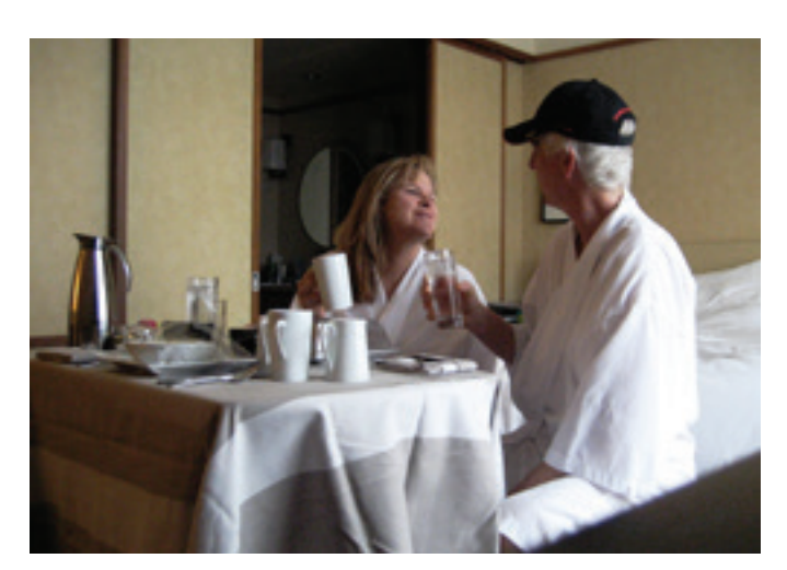
PHOTOS | (Top) Preparing to go underground. (Middle) Pike Place Fish Mongers. (Bottom) Enjoying Pan Pacific's room service. TOC Pike Place Market.